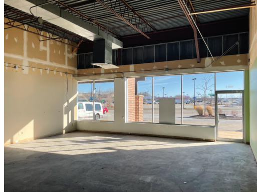
3,000ft 2 Retail/Office Space

Interior views of central space located between Rainbow and H&R Block. Features storage and private entry in rear. Approximately 29'5" x 101'5".