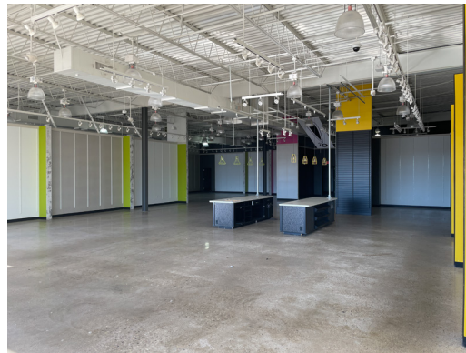
6,600ft 2 End Cap Retail Space

Interior views of northeast end cap space. Features drinking fountain, two bathrooms, dual entry, 6-stall fitting room, and two storage rooms.